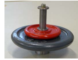
Fig. 2. The 7.025 Kg payload

Then, the new drive gains for joints 1 to 4 are identified