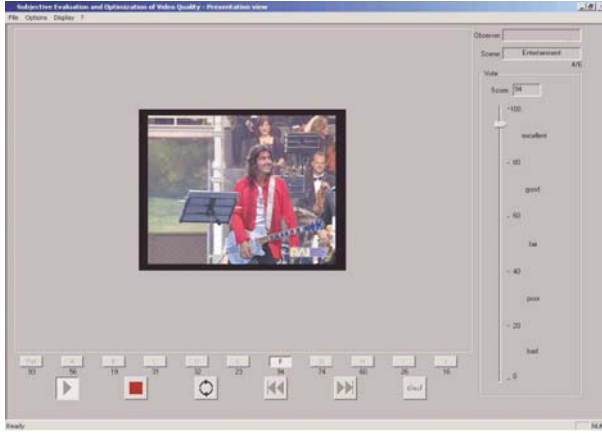
Figure 2 - SEOVQ User Interface.

systems. Further, there is no continuous sequential presentation of items as in double-stimulus-continuous-quality-scale (DSCQS) method: this characteristic reduces possible errors due to a lack of concentration, thus offering higher reliability. Nevertheless, since each sequence can be played and assessed as many times as the observer wants, it is time consuming and less conditions can be tested during a session.